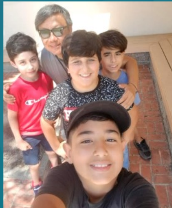
VBS small group

God has provided us an open harvest field that doesn't require an air ticket to serve in our neighbor El Cajon, a unique town mix of ethnicities from the Middle East waiting for us to meet and serve the needs of Muslims Refugees. We praise God that we have reconnected with some families since last year through our backpack drive. Also, we are so blessed to have 35 children with mostly Muslim background