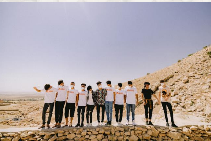
Some of the youth whom we work with. They are dancing a traditional Yazidi dance.

As you read this — the reality is God does not need you anywhere. There are many others who can serve or be a part of the Kingdom — whether it be at home or abroad. The faith and privilege that we have are what makes following Jesus so bold. My realization is if we keep looking for an open door — we'll never realize that we have walked through the door to which we were called. For me, I have realized that I have walked through that door — I have a conviction to return back to Kurdistan to share the gospel and to serve the people.