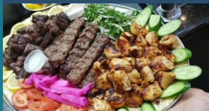
Traditional Middle East kabob plate