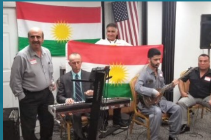
Kurdish New Year festival

The cross-cultural differences and the language barriers between the Syrians, Iraqis Kurds, Arabs, and Chaldeans might not help the ministry any easier but it keeps us striving to learn from them every day. We are also aware of the current situation of Afghanistan and preparing for the next wave of possible immigrants arriving at El Cajon. The Harvest truly is great and needs laborers, therefore we pray the Lord of the harvest to send more workers. We are very conscious if not for the work of the Holy Spirit leading and intervening, we dare not expect to move an inch of God's kingdom. He is the one who changed hearts, we are there to sow seeds and pray and pray like Jesus teaches us how to pray.